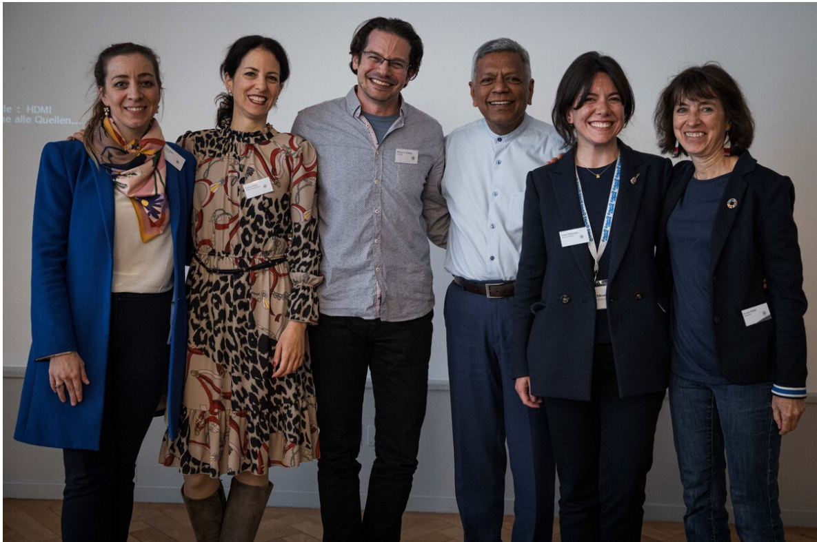
MMS SRHR-Conference 2024.