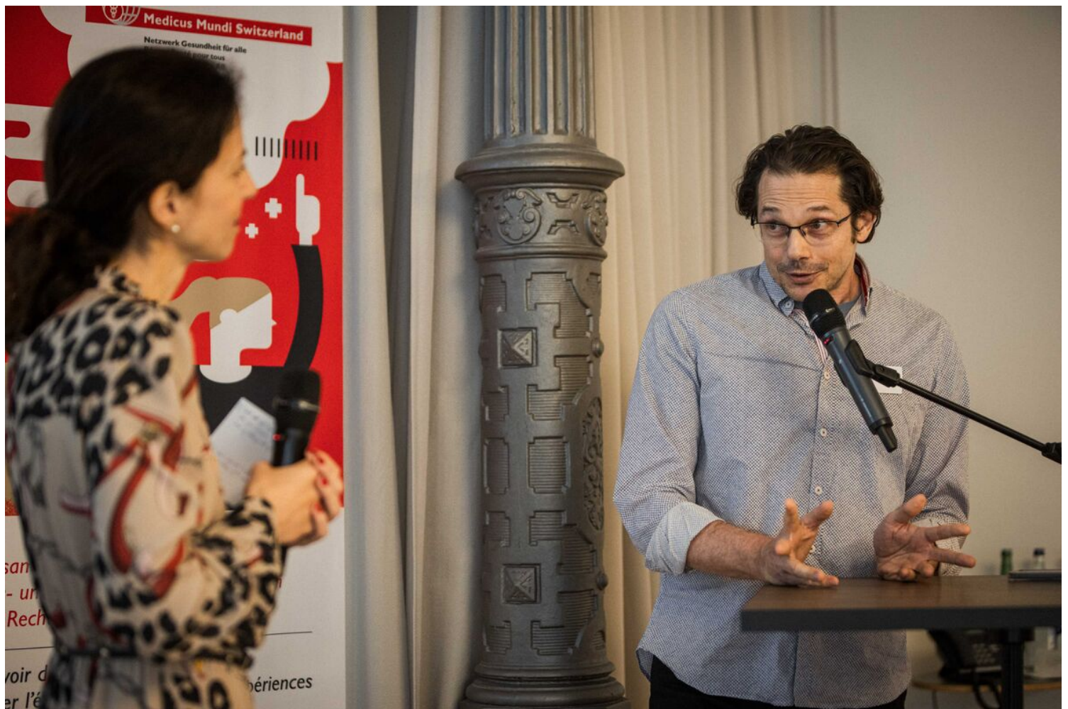
BAR TALK MMS SRHR-Conference 2024.

In 2022, SolidarMed performed a pre-assessment in the village of Gombe, to understand the different perspectives, challenges, and needs around schoolgirls, early marriage and pregnancies, as well as the market dynamics. Extracts of the quotes during the Focus Group Discussions reflect the situation: