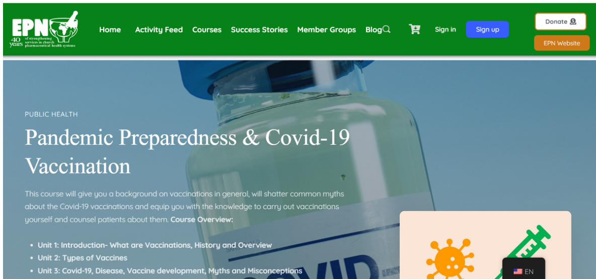
Screenshot of the EPN learning platform

Healthcare Workers: ACHAP partnered with Ecumenical Pharmaceutical Network and conducted a comprehensive training for 194 healthcare workers in eight countries which included Zimbabwe, Sierra Leone, Tanzania, Liberia, Central African Republic, Madagascar, Ivory Coast and Zambia. The training, which was both virtual and in-person for countries facing internet connectivity challenges, provided essential knowledge on health emergency preparedness and response, equipping these frontline heroes to tackle health crises effectively. See Course: ENGLISH, FRENCH