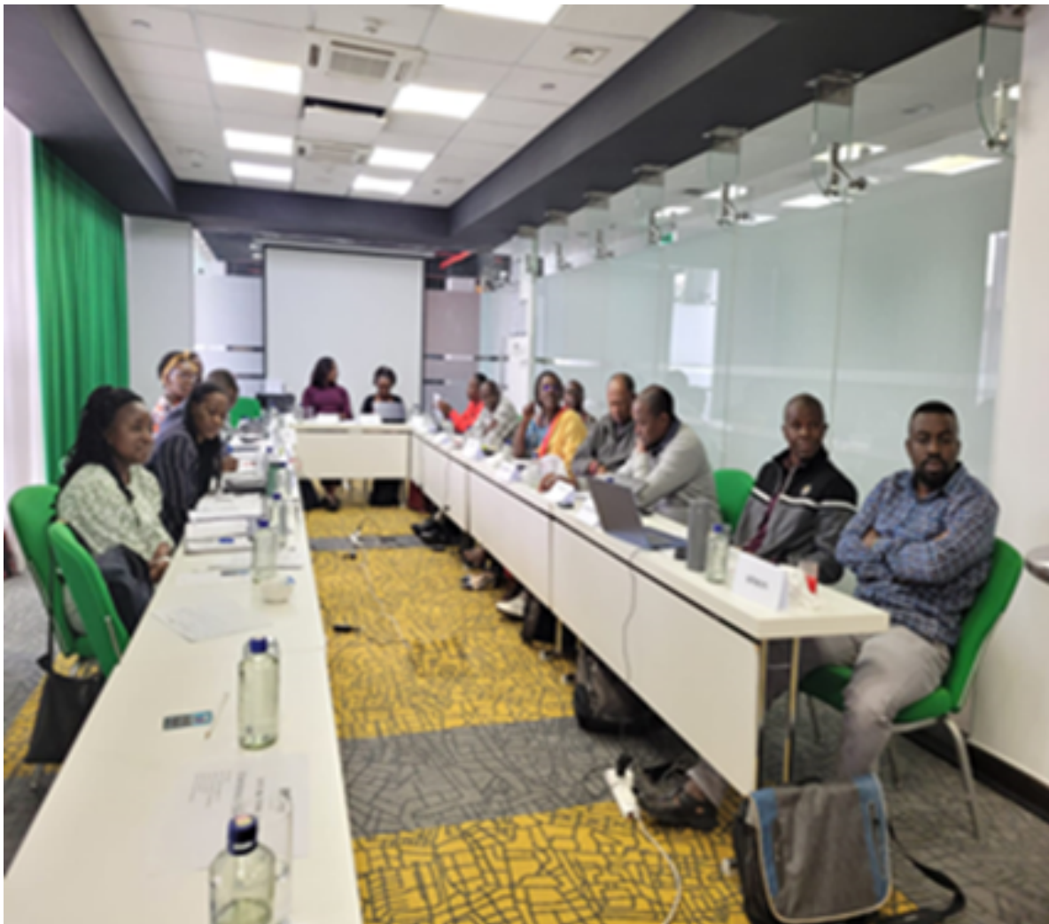
HEP training for member CHAs and ACHAP staff.

Through a comprehensive situation analysis, ACHAP identified influential structures within communities that were underutilized but had the potential to reach and influence other community members, even in the most remote areas.