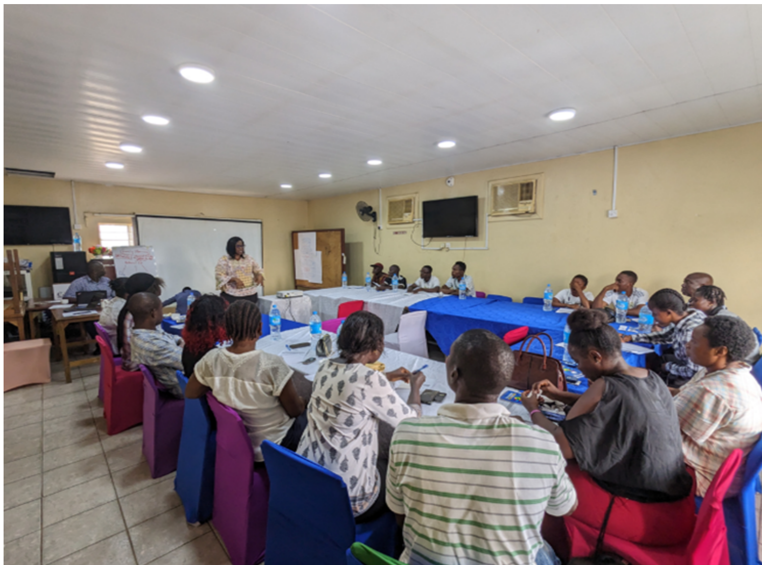
Healthcare workers training on HEP in Sierra Leone.