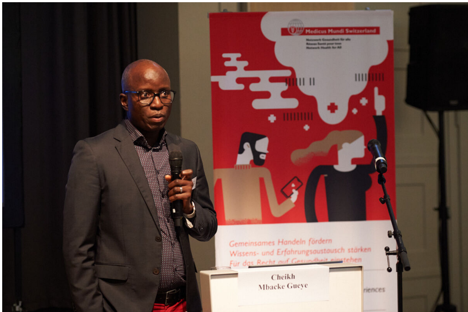
MMS Symposium 2023.

If money is power, then those providing it, i.e., donors are de facto influential stakeholders. This power, however, can serve as a catalyst to level out power dynamics that pervade the Development and Cooperation Sector.