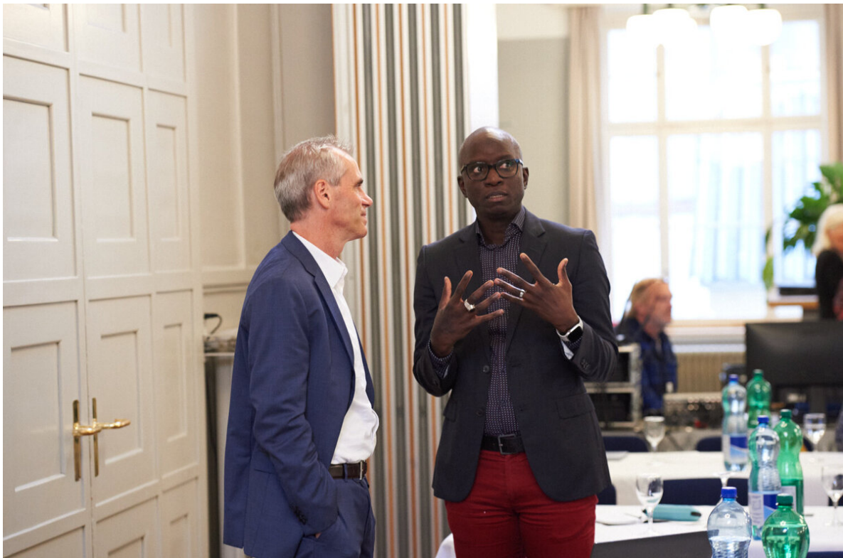
MMS Symposium 2023.

Funding organisations can play a pivotal role in decolonizing aid by using their power to create a space of trust and mutual respect where partners could engage at eye-level.