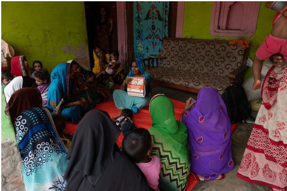
A trained community health volunteer, disseminating NTD messages to the mother group.

Self Help Group: Group of people affected by either leprosy or lymphatic filariasis. They are officially registered, meet once a month, are trained on self-care by health post in-charge and registered in the health post to facilitate timely follow-ups if needed.