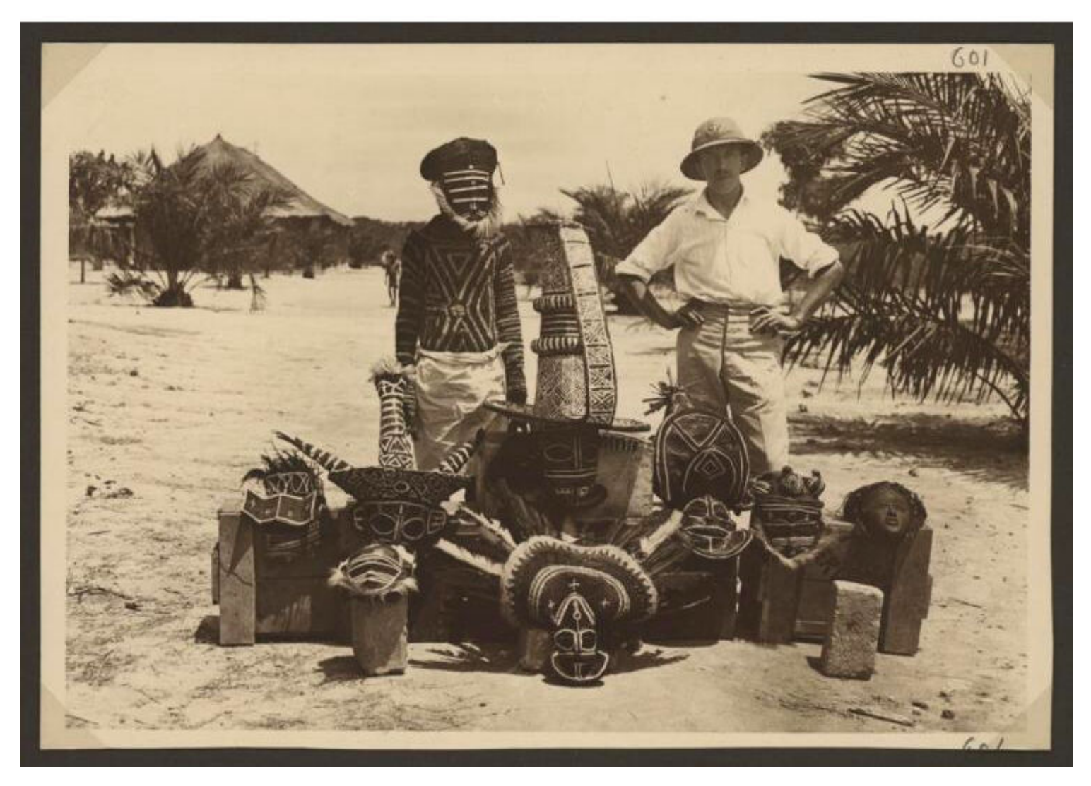
Colonial picture