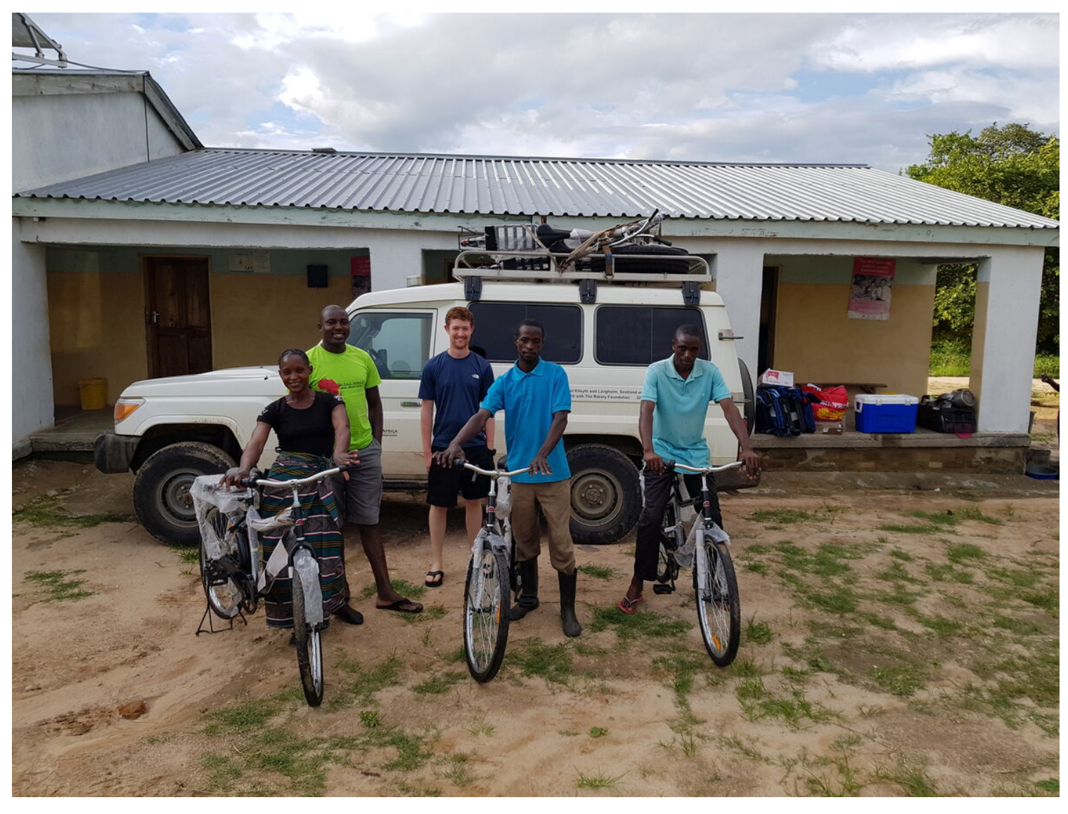
Equipping On Call Africas Community Health Workers with bicycles.