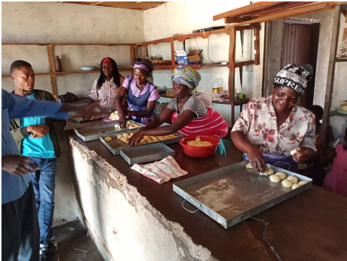
Bun baking initiative started within CKT group, sold for income.