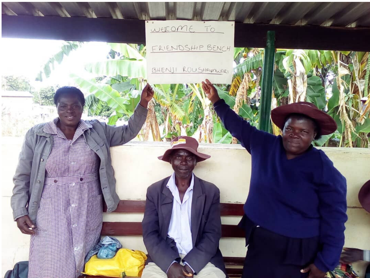
Lay village health workers offering mental health services at a rural clinic in Zaka district, Zimbabwe.

well as detect and escalate more severe cases. After screening patients for CMDs using a validated and culturally appropriate tool – the Shona Symptom Questionnaire (SSQ-I4) – the lay health workers provide a talk-therapy intervention that combines problem-solving therapy with cognitive behavioural therapy elements. After the one-on-one talk therapy, clients are invited to a peer led support group known as Circle Kubatana Tose (CKT), meaning ‘holding hands together’. This safe space contributes to the clients’ sense of belonging, reduces stigma surrounding mental health, and further allows for sharing of personal issues. In these CKT groups, clients can engage in income generating activities, relieving some economic burden. Previous trials have demonstrated that the Zimbabwean developed Friendship Bench intervention effectively addresses CMDs in a culturally appropriate way [Chibanda et al., 2016].