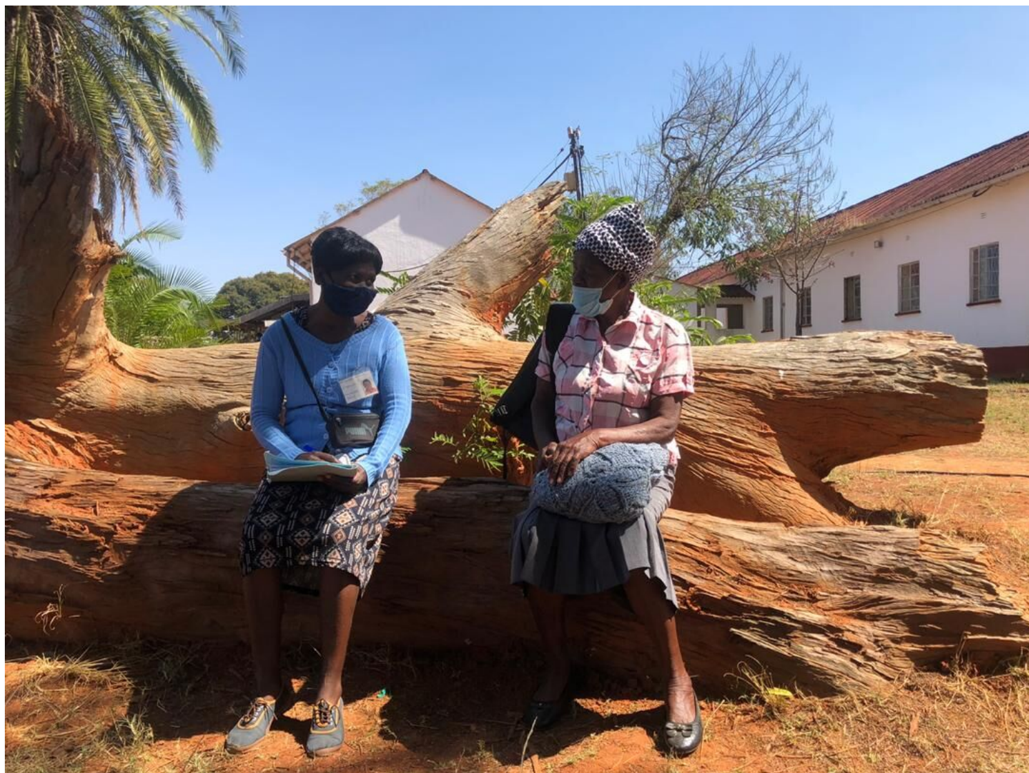
Village health worker providing mental counselling services at one of the hospitals in Zaka district.