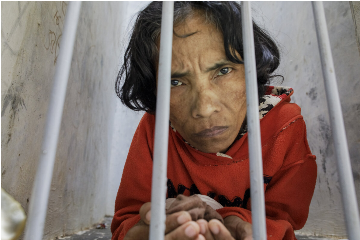
"A woman with a psychosocial disability lives confined in a bare narrow cell at madrasah Ar-Ridwan, a private Islamic healing center in Cilacap, Central Java, Indonesia.