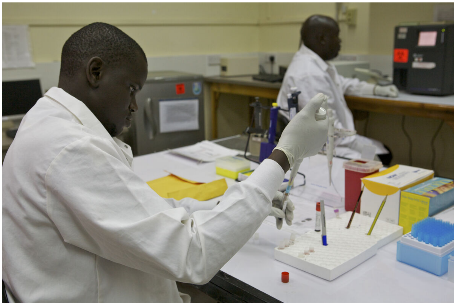
Kenyan Researchers