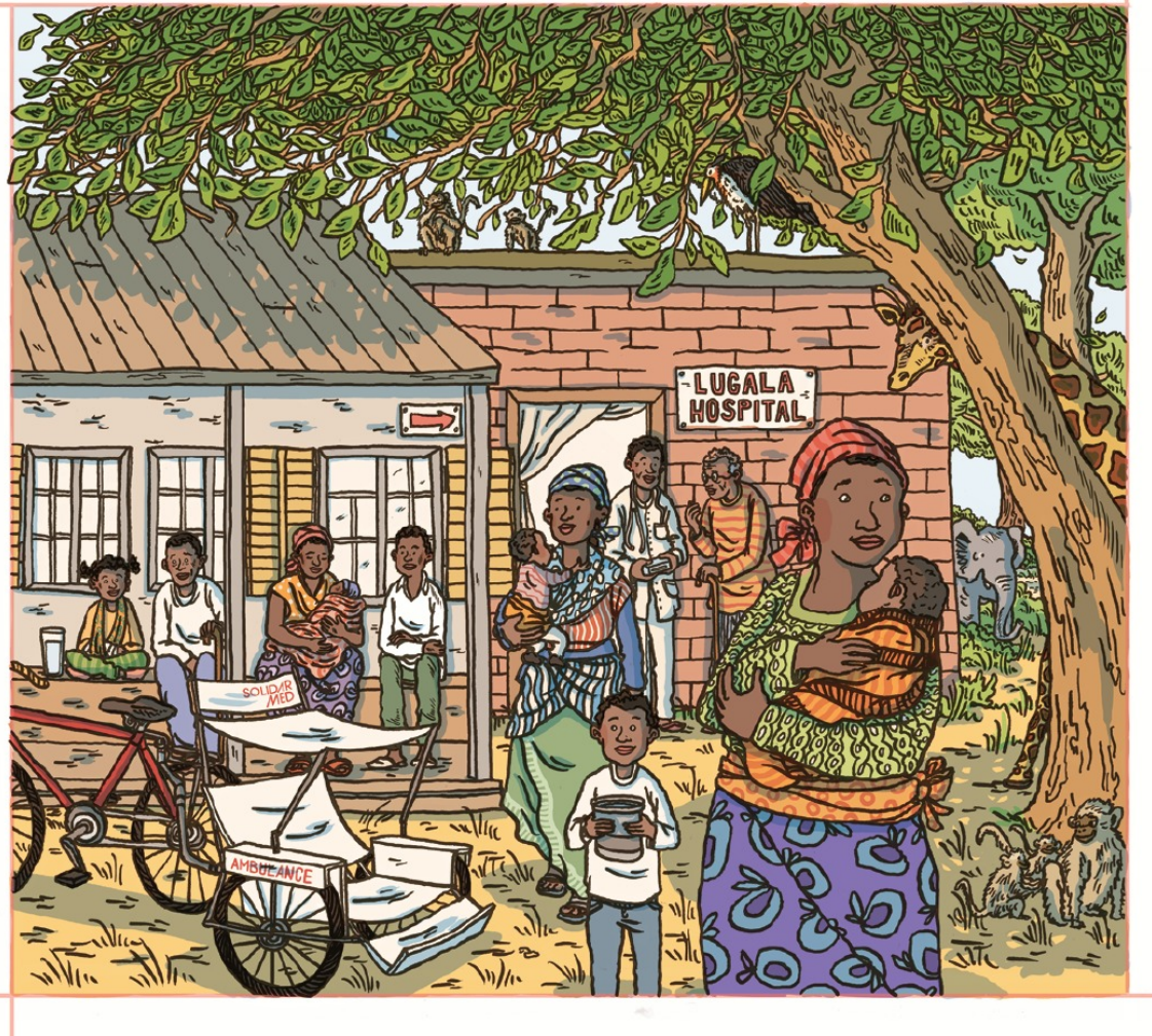
The Lugala Hospital in Tanzania; Illustration: Anna-Lea Guarisco