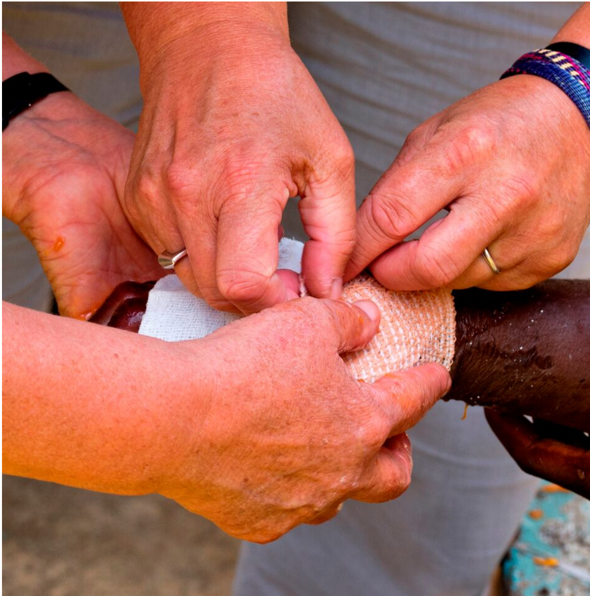
Multi-sectorial collaboration for the ones in need