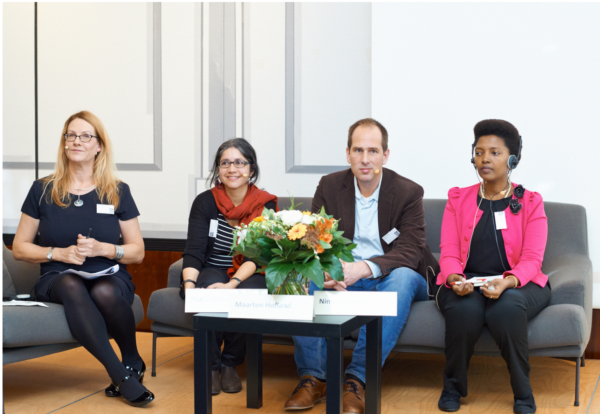
Panel discussion at the MMS Symposium 2016