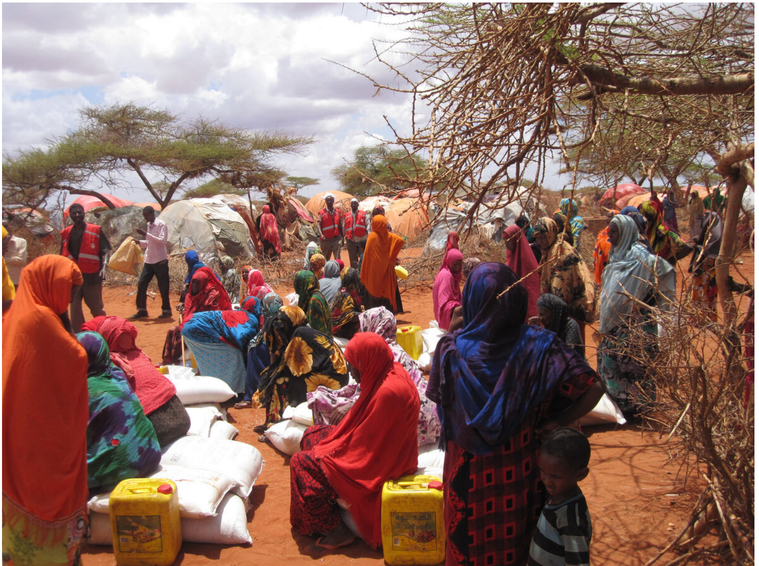
The ICRC in the field - Somalia.

In a growing number of countries, the implementation of health programmes is challenged by a fragile context. At the same time, State fragility is considered one of the main causes of malfunctioning health services. Emergencies aggravate such situations and bring to light systemic weaknesses. They raise questions relating not only to how to adapt to a shaky working environment or programme sustainability, but also to whether health programmes can help reduce fragility. In order to consider these multifaceted challenges more closely, the Swiss Red Cross (SRC), the Swiss Agency for Development Cooperation (SDC) and Medicus Mundi Switzerland (MMS) hosted a conference in August 2016 that focused on three key questions: