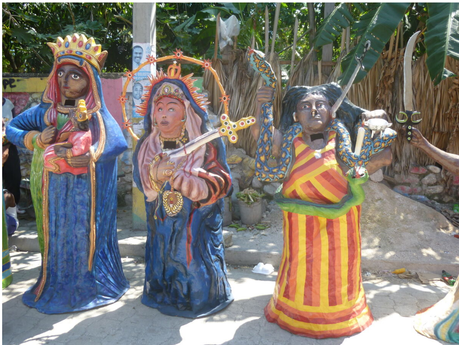
Carnival in Jacmel, Haiti, 2011

I studied psychology as my first degree. After graduation I feared I did not have the strength to face people with mental health disorders and I therefore specialised in public health. During three years living in developing countries I encountered many people with mental health disorders. In Haiti a naked woman ran around in the market and a man got drunk on a regular basis in front of our compound. In Myanmar we employed a doctor not realising that he was suffering from severe alcoholism. He failed to make it to the duty station because he got totally drunk on the way and did not stop drinking for four entire days. From one day to the next a young women had to take care of her entire family because her mother was arrested for having drugs in her house – drugs someone else had left there. Working with these communities, I looked into many sad and depressed eyes.