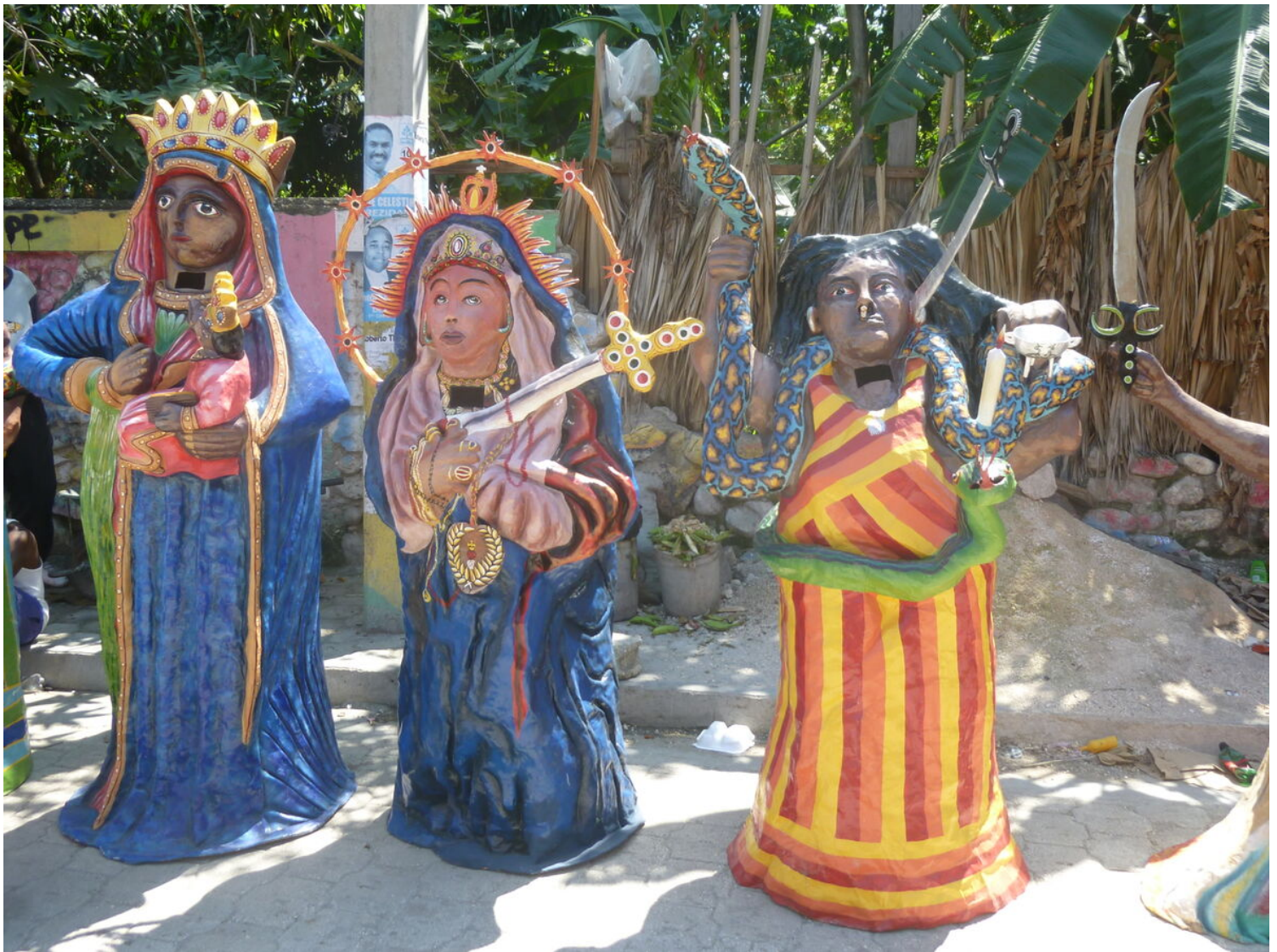
Carnival in Jacmel, Haiti, 2011

I studied psychology as my first degree. After graduation I feared I did not have the strength to face people with mental health disorders and I therefore specialised in public health. During three years living in developing countries I encountered many people with mental health disorders. In Haiti a naked woman ran around in the market and a man got drunk on a regular basis in front of our compound. In Myanmar we employed a doctor not realising that he was suffering from severe alcoholism. He failed to make it to the duty station because he got totally drunk on the way and did not stop drinking for four entire days. From one day to the next a young woman had to take care of her entire family because her mother was arrested for having drugs in her house – drugs someone else had left there. Working with these communities, I looked into many sad and depressed eyes.