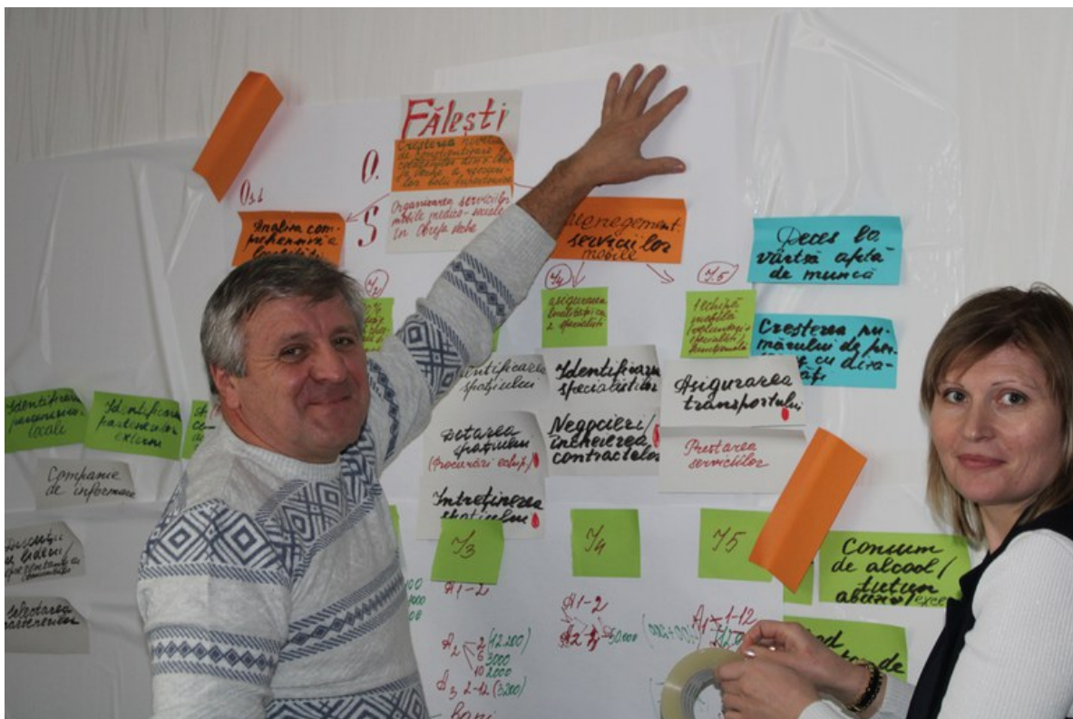
Capacity building, health promotion - learning how to plan successfully a project on health promotion during a workshop organised by Healthy Life project.