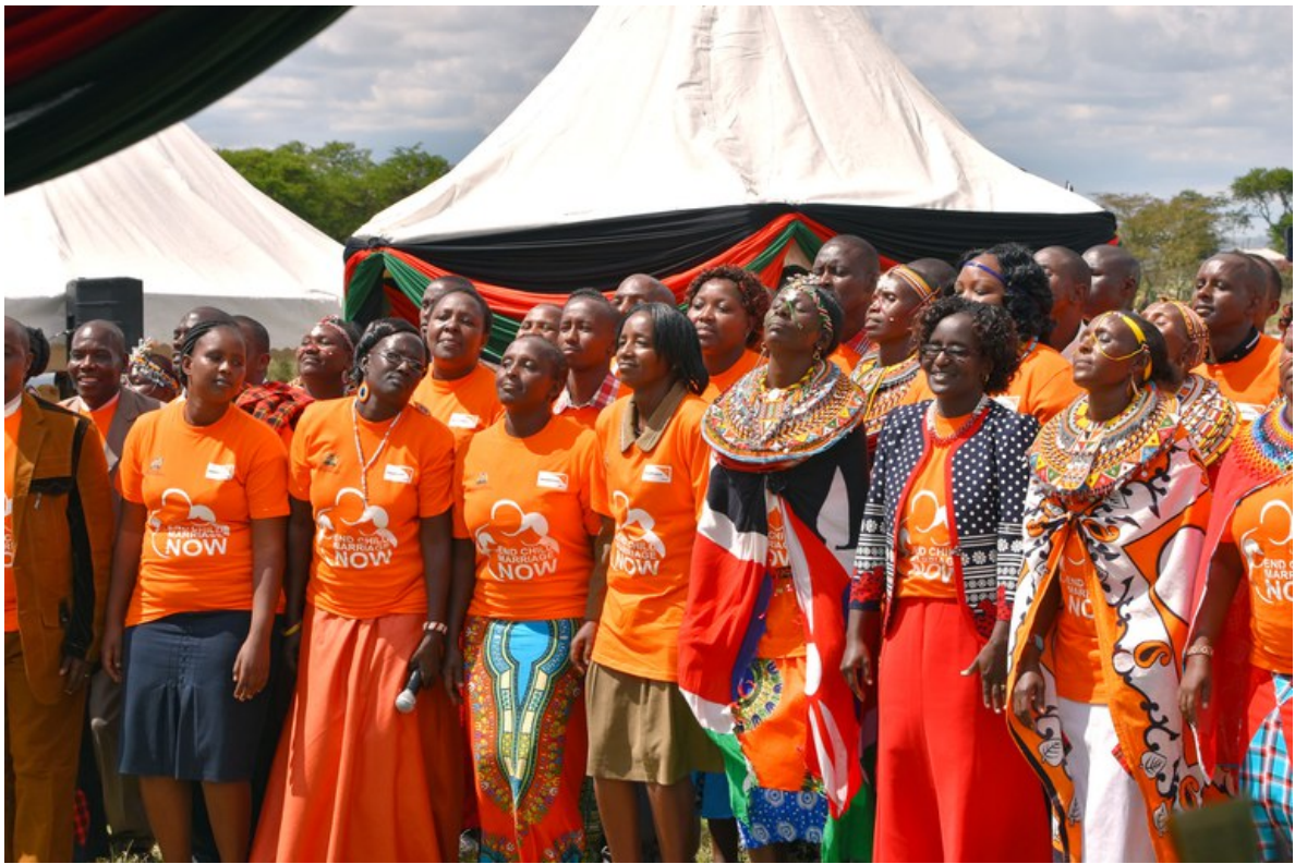
Kajiado Community members participating in an Anti-FGM and ending Child marriage during the 16 days of activism in Kenya. Orange The World 2016 - Kenya.

FGM involves over 200 million women across the globe and Nigeria has one of the highest rates. This practice is done in the name of tradition and the whole point there of is to control female sexuality.