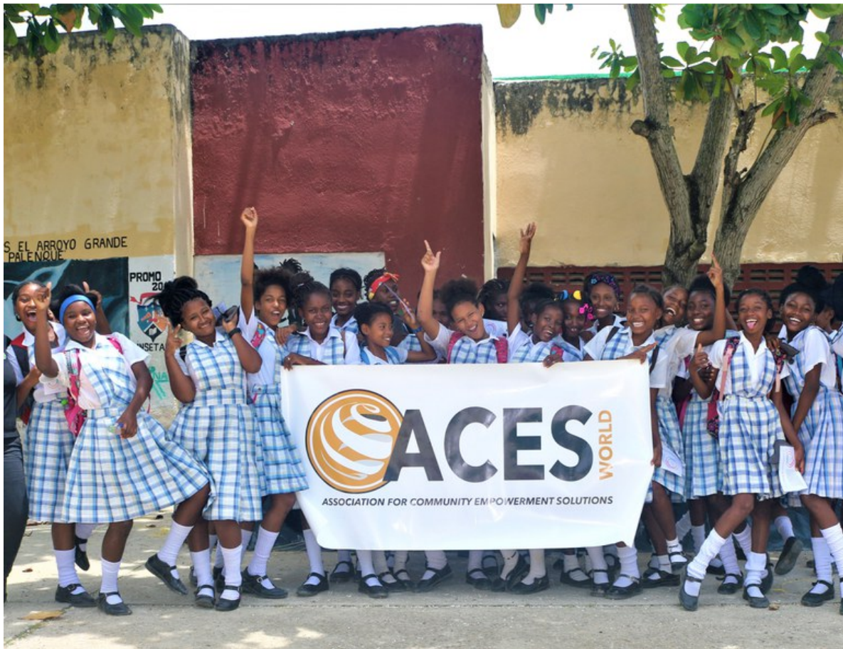
Students in Ghana celebrating the completion of P4L with their cloth pads.