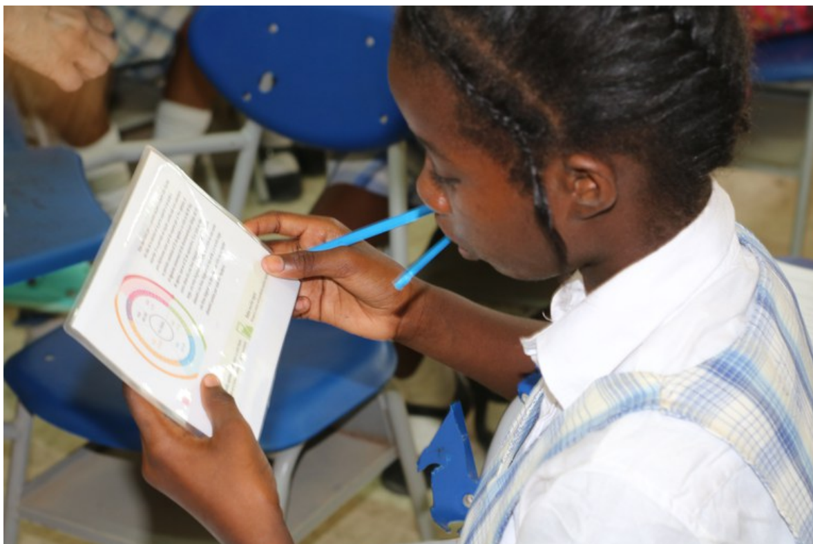
Students in P4L reproductive health class in Colombia.

Beyond our target group and the direct impact experienced by the 100 girls, reproductive health education was spread within the larger community. Based on an evaluation survey question asking how many family members, friends, and/or classmates students shared the information learned from P4L, this impact was assessed and identified as having a multiplier effect. Information is disseminated by teenagers, who become the agents of change rather than ACESWorld personnel, and knowledge spreads as education is provided to the larger community and continued after the project ends.