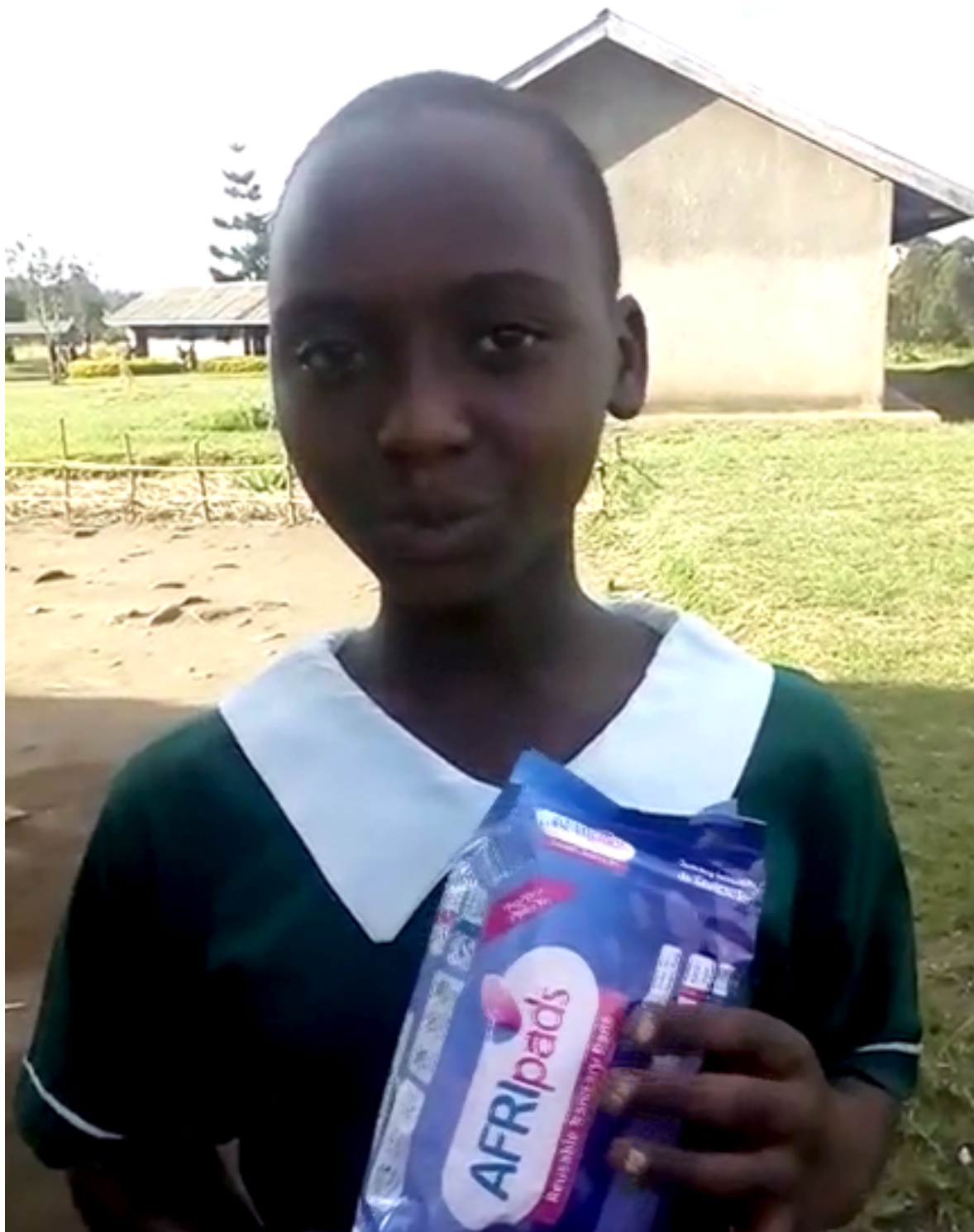
Pads4Learning participant with Afripads in Uganda.

better health outcomes, such as reduced child marriage and early pregnancy. A 15 years old is twice as likely to die during childbirth compared to those aged 20 years and above (UNFPA 2019). Maternal schooling plays a key role in determining children's chances of survival in low- and middle-income countries. In Uganda, the odds of dying for children of women with one additional year of education are 16.6 % lower (Andriano & Monden 2019).