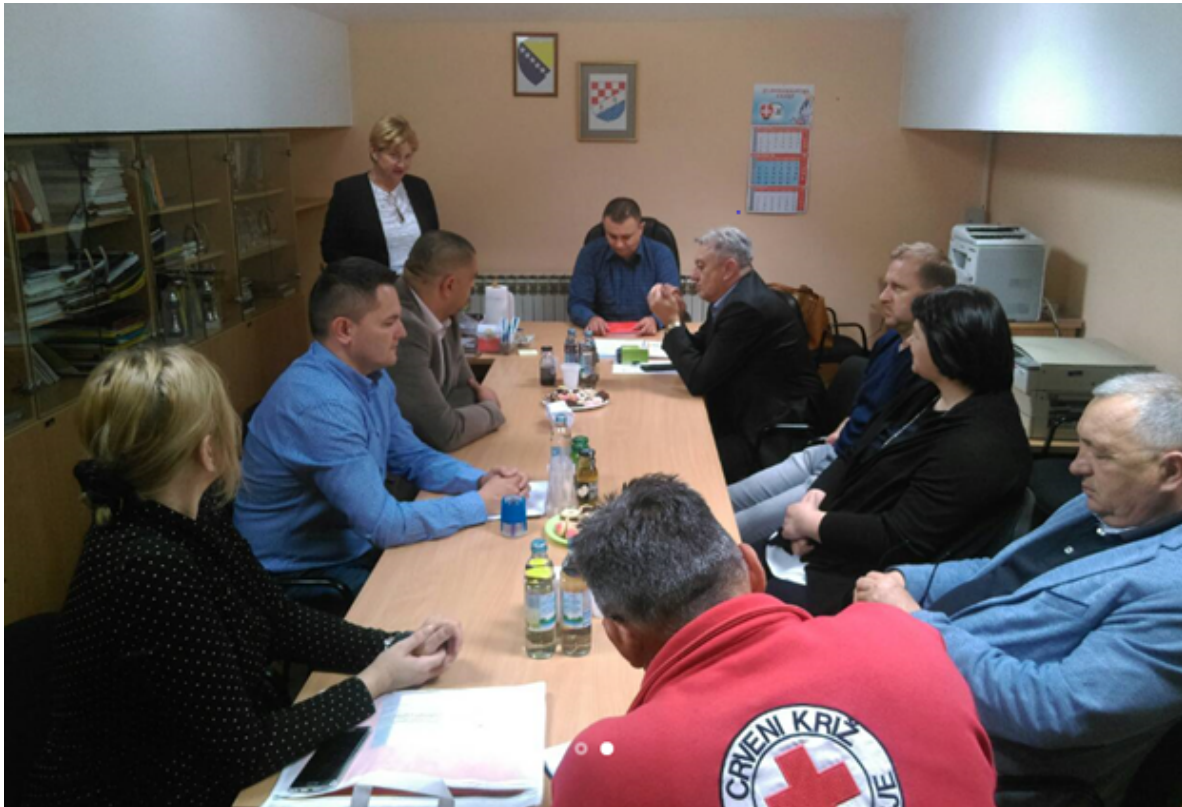
Inter-institutional collaboration in Orasje: signing of collaboration agreement.

Between April and September 2019 in Dobož 1827 home visits were provided by 12 nurses for terminally ill patients and, during the same period, 232 visits were performed by 10 nurses in Orasje (beginning of the project, which started later).