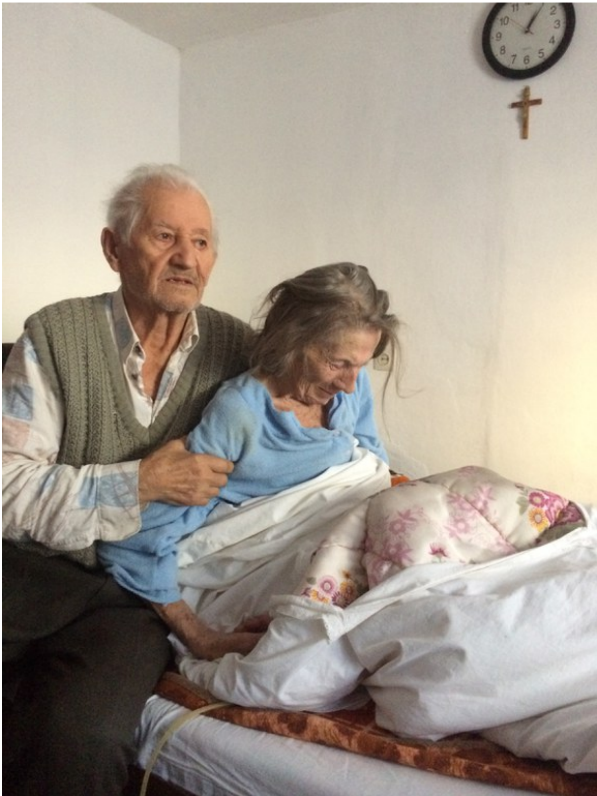
Old couple, husband holds wife.