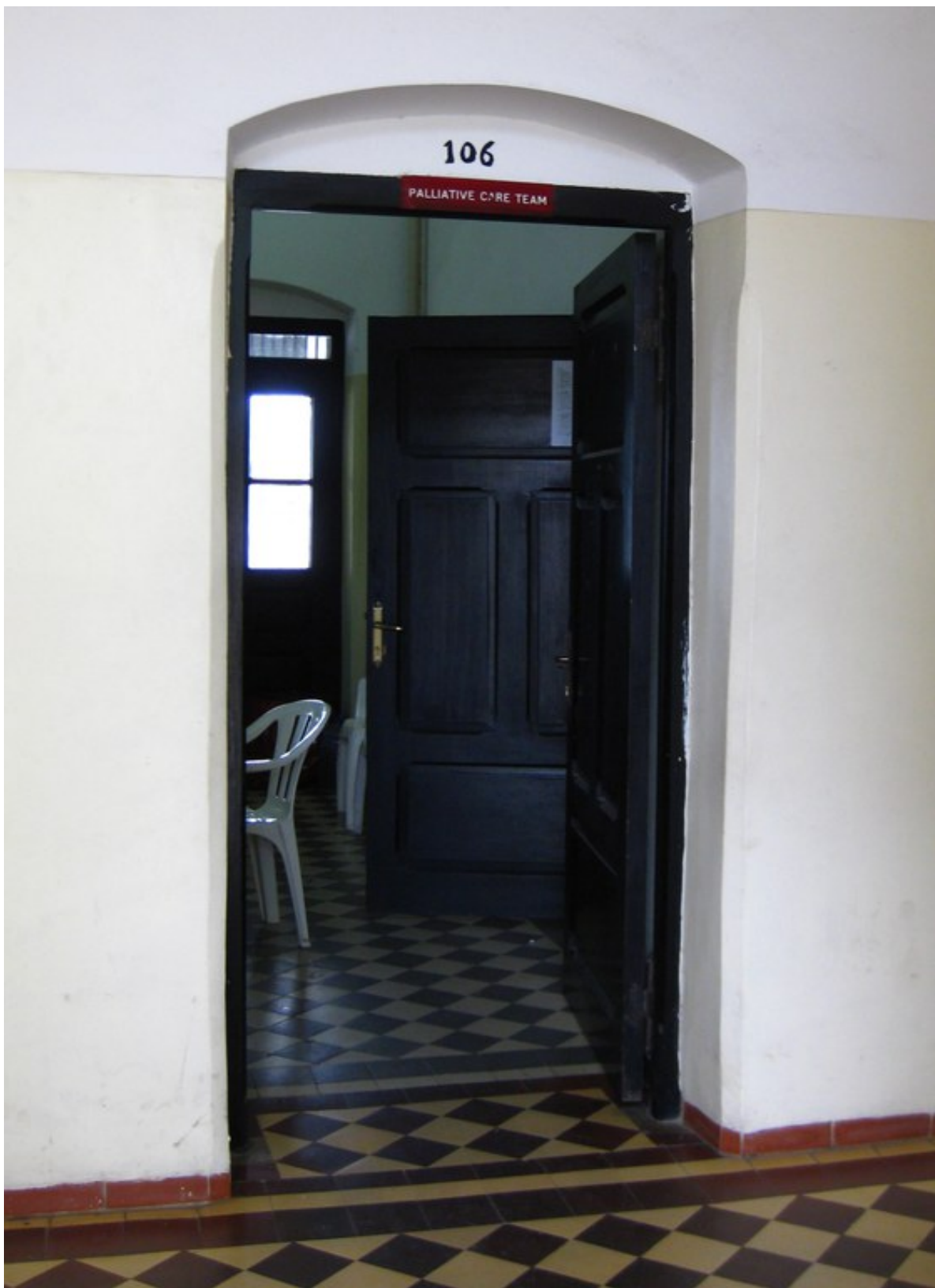
Palliative care counselling room at ORCI.

The majority of patients come from faraway places across the country and travel far to reach the hospital, often without accompanying relatives providing the necessary care. Thus, most of them are dependent on in-hospital support. The hospital palliative care team's duties are taking care of in-patients with palliative care needs, especially pain management, counselling out-patients and their relatives, organizing home-visits, and supporting and training hospital staff