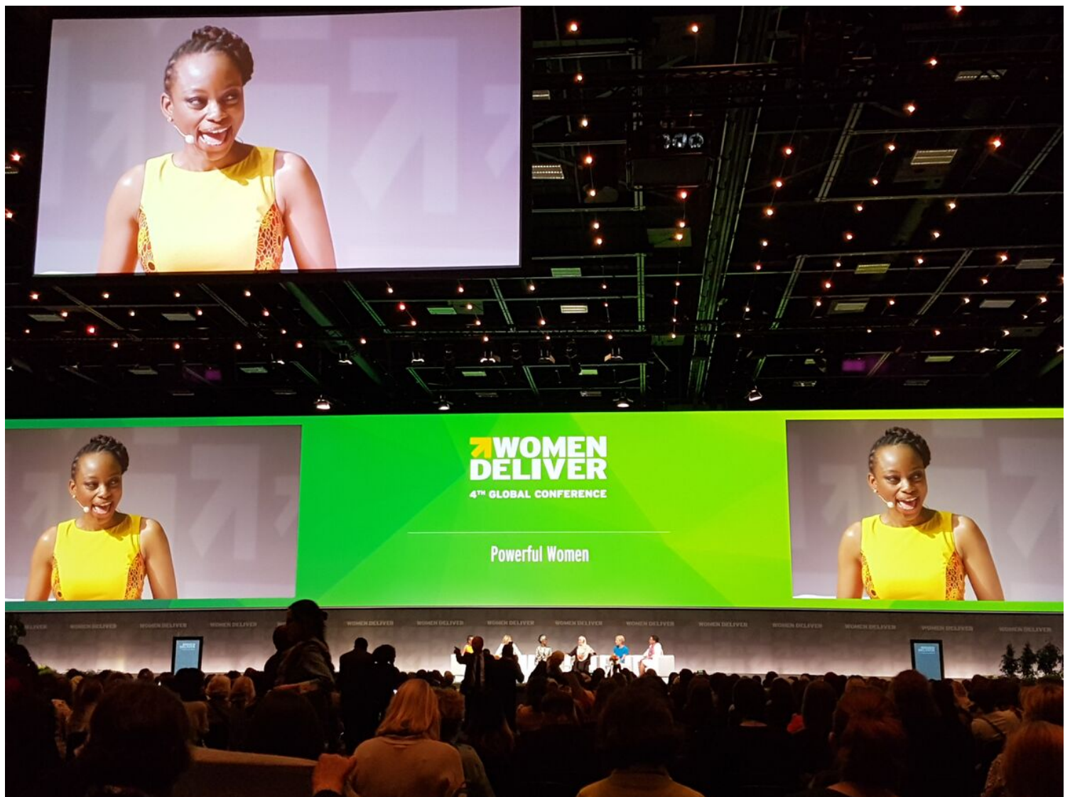
World Deliver Conference 2016

Jill Sheffield, a global advocate for maternal, sexual and reproductive health and rights, launched in 2007 the first Women Deliver Conference - which evolved into an international advocacy organization aimed at generating the much needed political will and investment to meet MDG 5 by 2015.