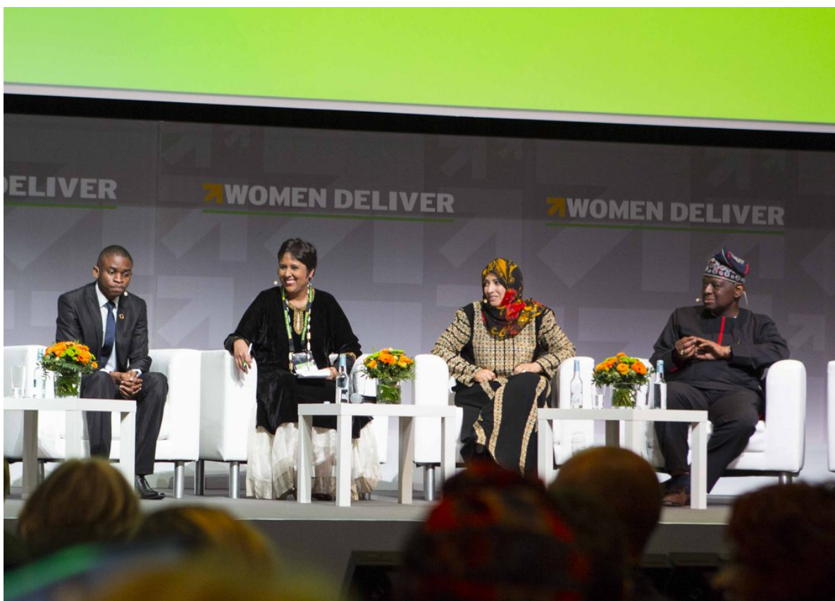
World Deliver Conference 2016

Strengthening accountability was indeed a term frequently discussed in relation to sexual and reproductive health and rights at Women Deliver 2016. This is a broad concept which includes political, legal, social and professional accountability – which linked duty bearers to the right holders. Kate Gilmore - the United Nations Deputy High Commissioner for Human Rights – emphasized this point by saying that accountability has to become an element of the Theories of Change we are working with. Accountability is not a standalone initiative, but needs to be supported by sound evidence and strategic advocacy. It was mentioned that the term accountability is not a static word but embodies voices and refers to a mechanism that is actionable and should be answerable to right holders.