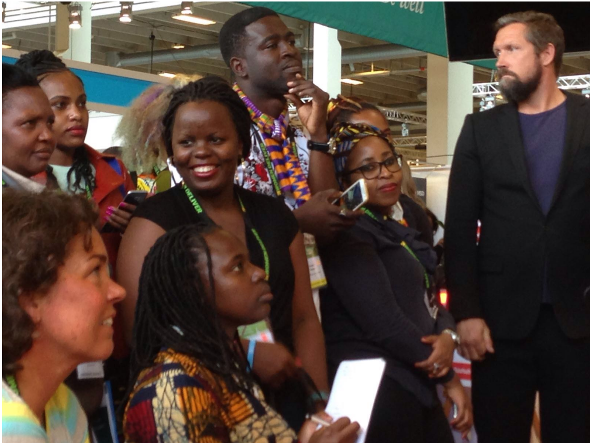
World Deliver Conference 2016

Women Deliver has developed a Young Leaders Program , which provides opportunities for youth advocates to build and strengthen their capacity and skills and find platforms for them to share their voices and experiences.