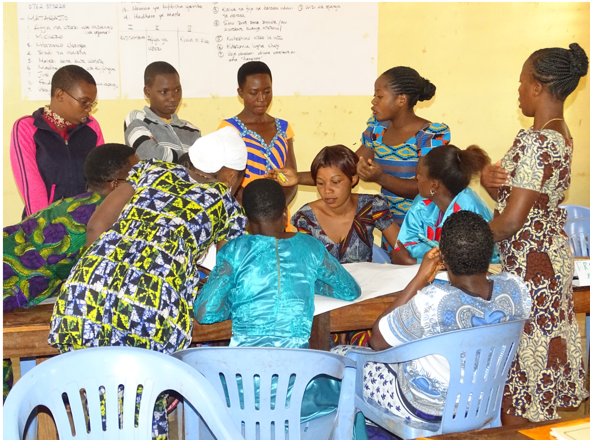
Creating space for quality participatory processes.