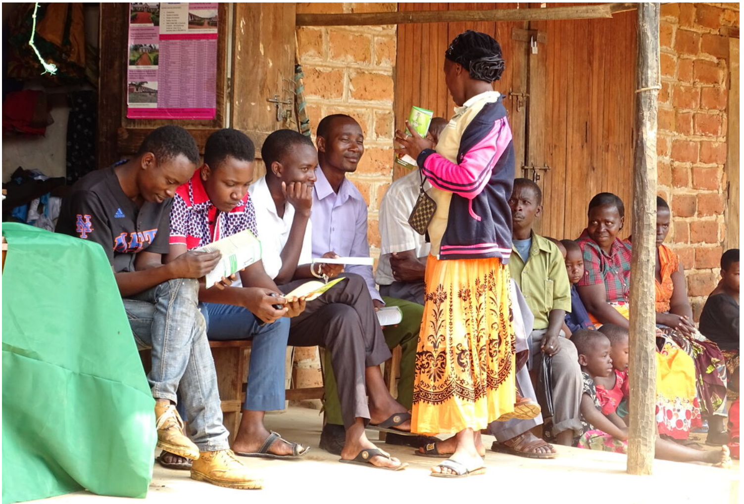
A girl peer educator sharing knowledge at street joint in a village in Kigoma.

The nature and severity of acts of gender-based violence (GBV) is alarming in Tanzania like in many other countries in the world. With 70% of its population below 35 years old, efforts to address GBV in Tanzania must focus on young people. terre des hommes schweiz uses youth participation, solution-focused and psychosocial approaches in the country to empower young people from excluded and vulnerable groups to engage in actions to prevent and respond to GBV in local communities. What can we learn from their approaches?