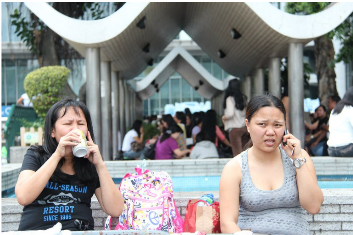
Calling Home: Migrant Workers in Hong Kong.

When in treatment for diabetes, migrants have a significant lower probability of adhering to guidelines or to be tested for HbA1c (glycated haemoglobin) measurement over time. (Ballotari et al. 2015; Seghieri et al. 2019) Social determinants plays also a role in the self-management of diabetes, but there is a significant lack of research in this respect regarding migrants.