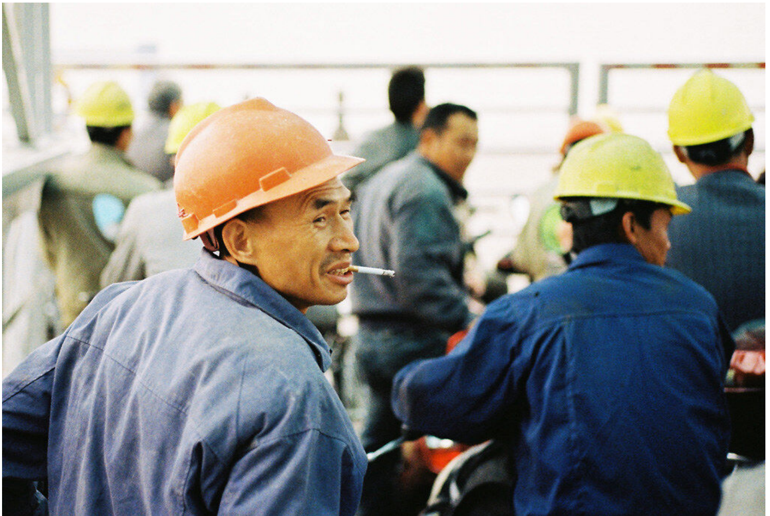
Migrant worker.

The relation between migration and health is a complex one and should not just be reduced to the health “of” migrants, but encompasses other aspects: migrant workforce is an important resource for our health system and migrants contribute greatly, through remittances, to the health of their own countries. (Ruggia 2016) However, when we wish to examine the health of migrants, the key explanatory concept that can be applied today is the one of the social determinants of health.