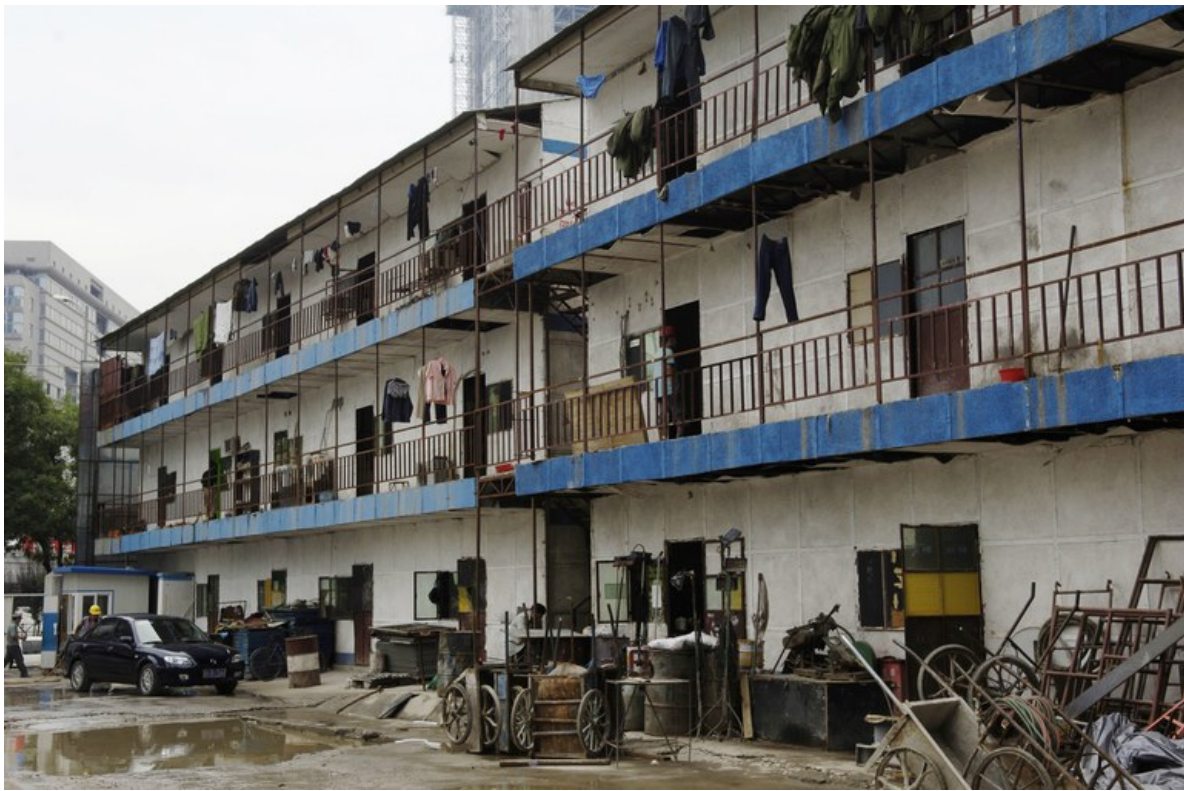
Migrant workers, Beijing.

Migration has not been always at the forefront of the SDH analysis. In the grounding document published by WHO in 2003, the word migration did not appear once in the whole text. (Marmot and Wilkinson 2003) Since 2006, the International Organization for Migration (IOM) addressed the fact that migration is a social determinant of the health of migrants (Davies et al. 2006), but it is only following the 62nd World Health Assembly (2009) resolution Reducing Health Inequities through Action on the Social Determinants of Health, that the IOM fully recognizes the importance of addressing migration as a social determinant of the health of migrants.